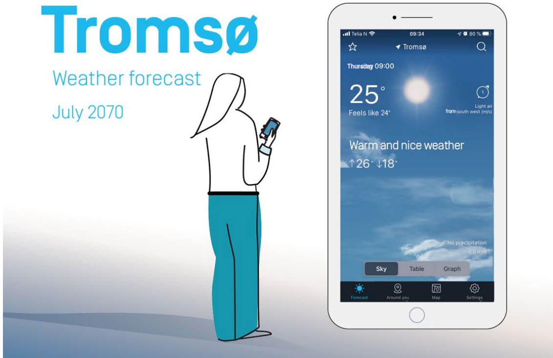
Figure 2: Example of how local angles on climate change can be visualized. Graphics: Mai-Linn Finstad Svehagen, MET Norway.

Meteorologists have a natural advantage when it comes to identifying what is relevant for their audience. The weather is an effective content frame for communicating climate change. TV meteorologists are familiar with the smallest nooks of their country and its weather particularities, and they are used to framing the weather forecast in a newsworthy and localized way, such as linking it to a major sports event or a national holiday. That is an excellent starting point for tailoring local climate change content and to prevent the audience from distancing themselves from the message.