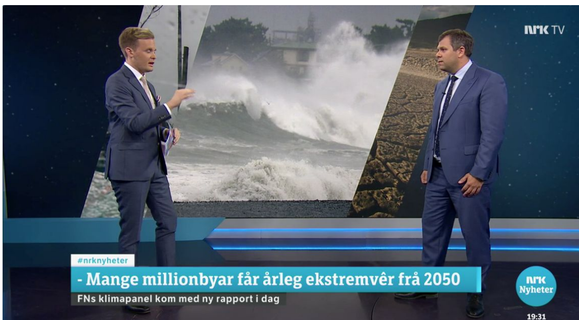
TV meteorologist Kristian Gislefoss and news anchor at the NRK Evening News.