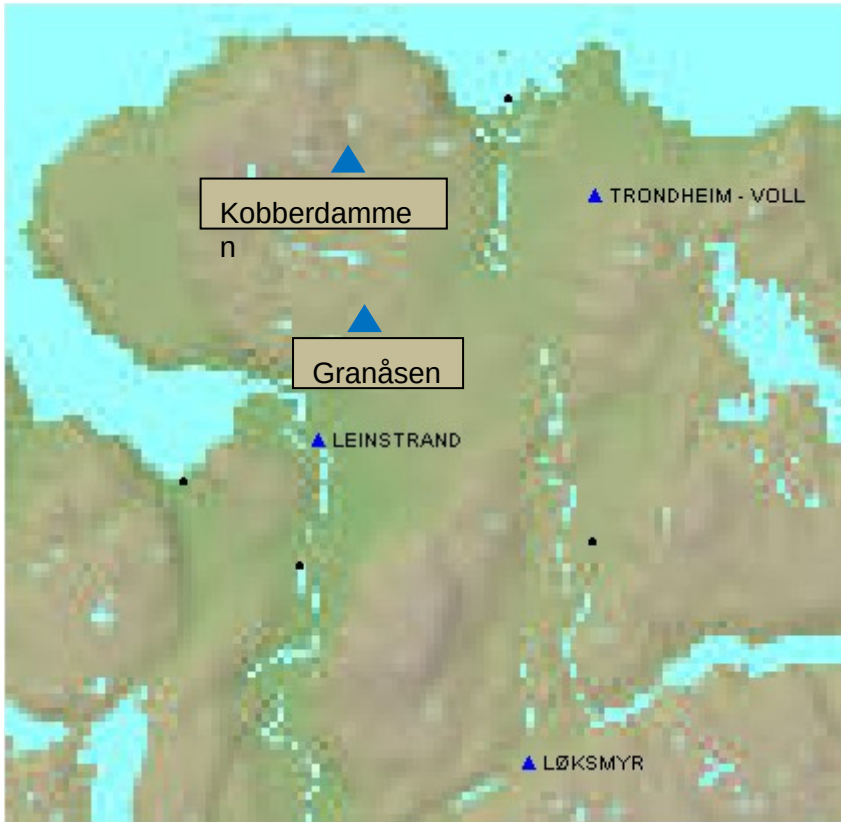
Figure 1. Location of the weather stations