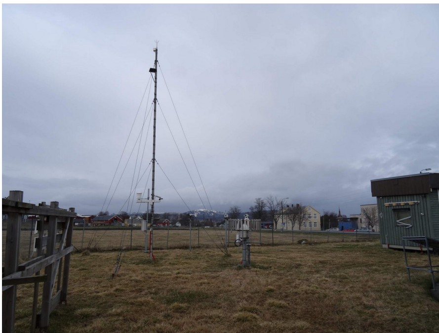
Figure 3. Voll meteorological station