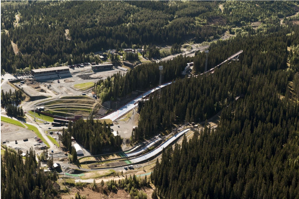
Figure 4. Granåsen ski jumping hill

The tables below show the number of days each month with highest mean wind below 1.5 m/s, between 1.5 and 2.8 m/s and above 6.7 m/s. Also the highest 3 seconds gust recorded each month is listed. The data are from Trondheim - Voll, but estimations for Granåsen are given in brackets. The calculations are performed by setting the wind at Granåsen as 70 % of the values at Voll.